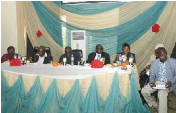
The High Table at the end of the year 2018 party of the Department of Obstetrics and Gynaecology