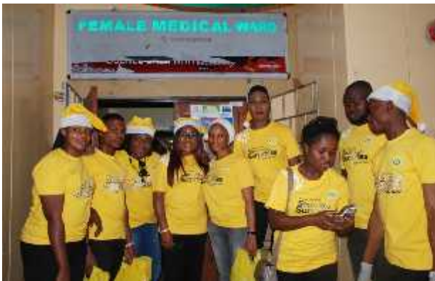
When MTN turned UATH "YELLOW" with gifts to over 350 in-patients in December, 2018.