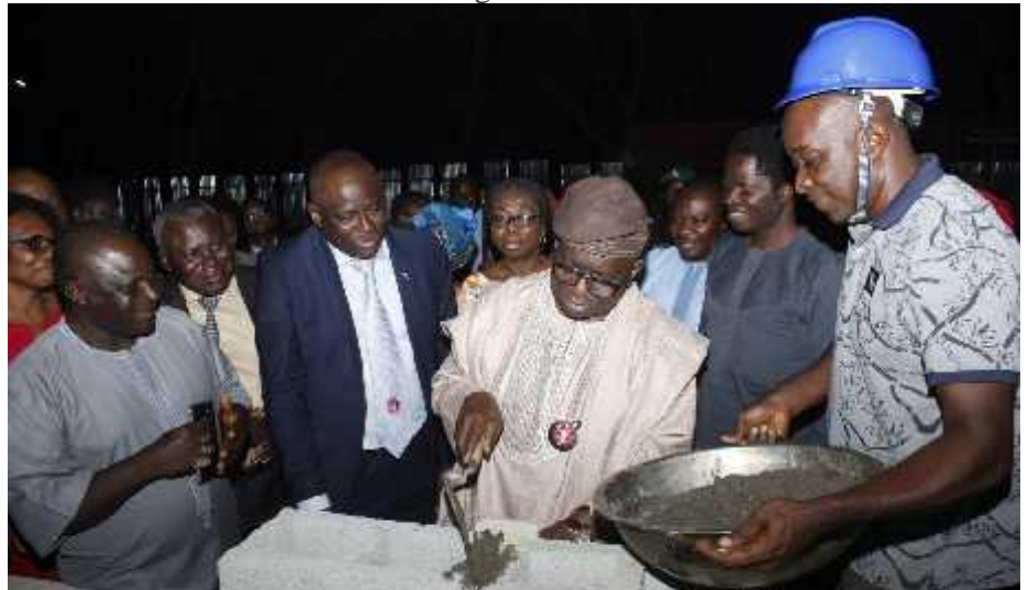
Minister of Health, Prof. Isaac Adewole laying the foundation for the UATH Accident & Emergency Extension.

He thanked the Minister for his pledge to assist the hospital in the execution of the project.