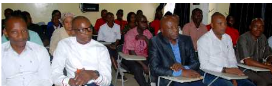
Cross Section of Staff of the Out-sourced services providers at the event.

He gave an assurance that the out-sourced service providers would improve on their performances in the new year. ■