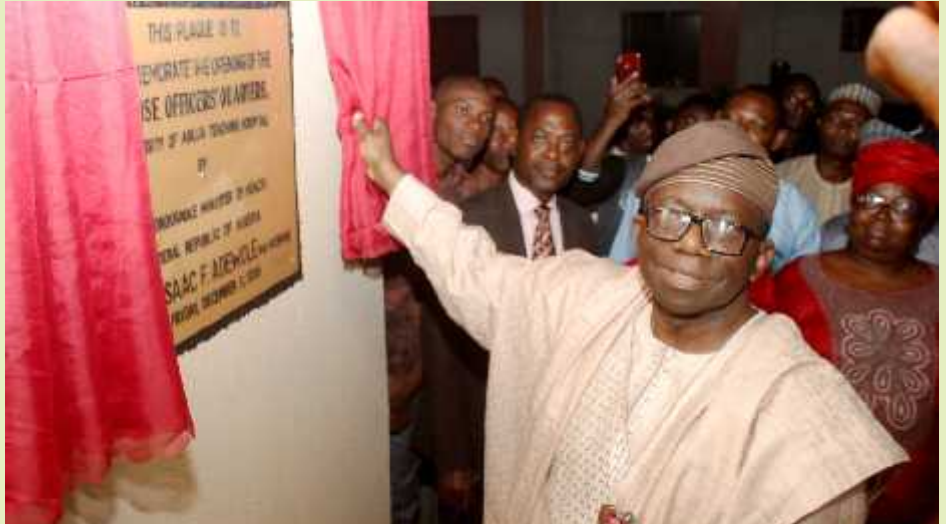
Minister of Health, Prof. Isaac Adewole, inaugurating the House Officers' Quarters.