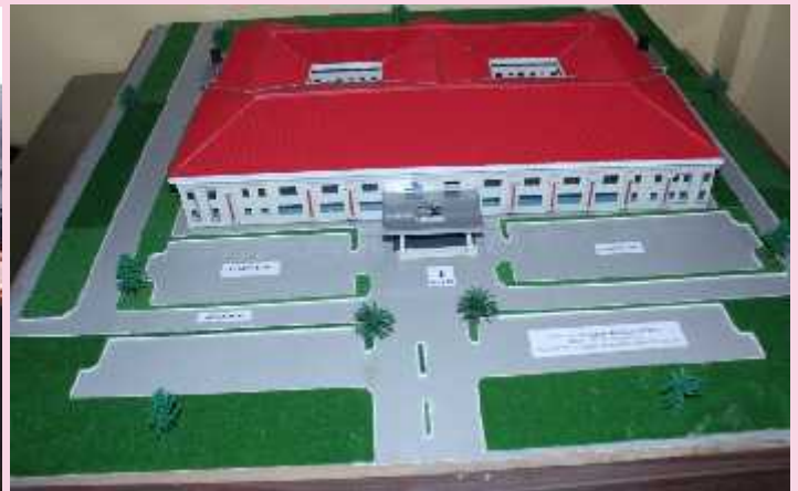
Prototype of the Ultra-Modern ENT Complex, University of Abuja Teaching Hospital.