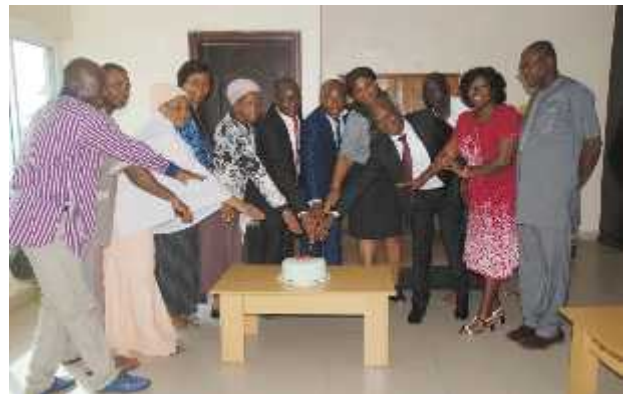
Members of the Committee on Infectious Disease Control and some members of the Hospital's Top Management Committee cutting a Cake to mark the end of a successful outing by the Committee in 2018.