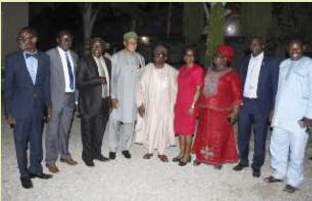
Some Board members in a photograph with the Hon. Minister of Health, Professor Isaac Adewole shortly after inaugurating the House Officers' quarters.