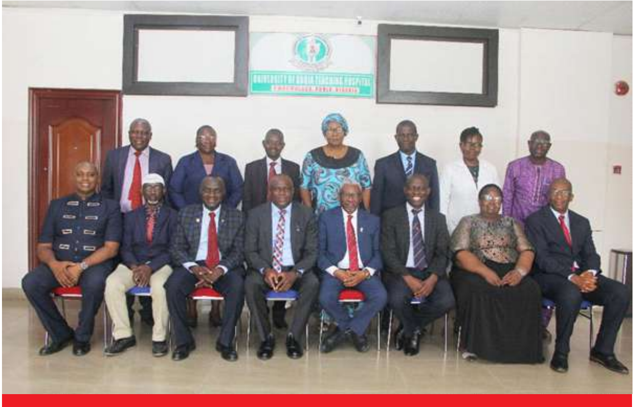
Group photograph of Accreditation team members with UATH Top Management Committee